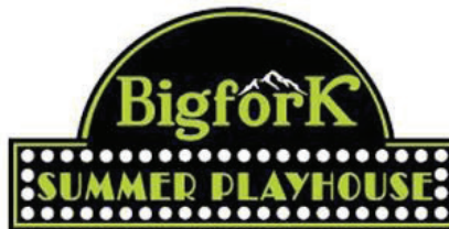
BIGFORK SUMMER PLAYHOUSE 2020 SEASON TICKETS FOR TWO