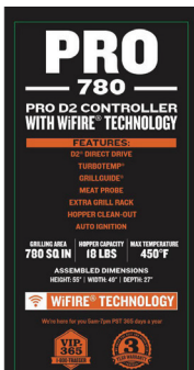
TRAEGER PRO SERIES 780 PELLET GRILL

Proceeds go directly to the Building Fund for the NEW CRESTON FIRE STATION!!