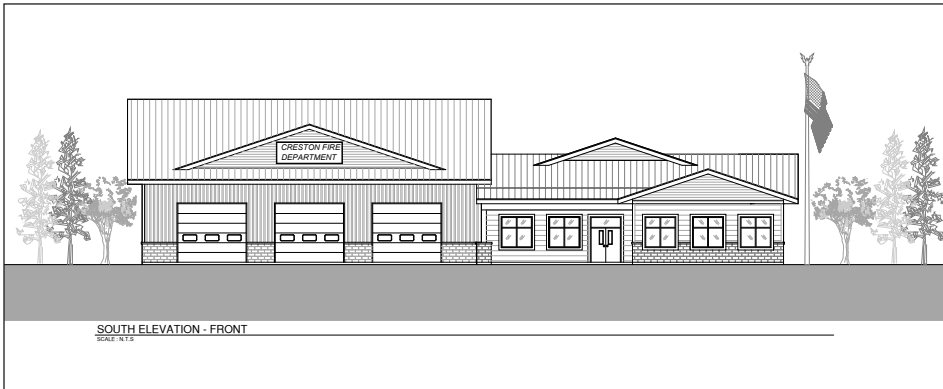
Preliminary drawing for Creston Fire Department's planned Station 251 on Hwy 35.