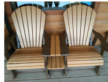
DOUBLE STATIONARY SETTEE